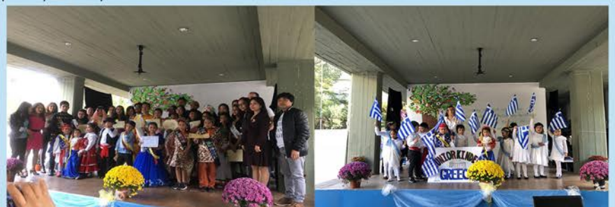
Representatives of different countries during the UN Day