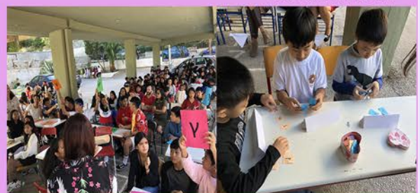
Activities and Games at the school ground during the Greek Day.