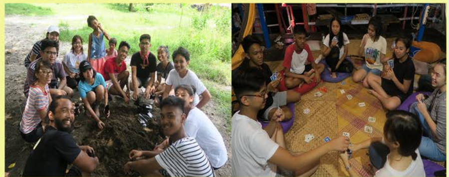
Delegates of the Youlead Immersion.