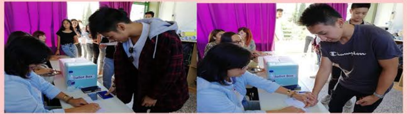
Pupils and students cast their votes during the SGO elections