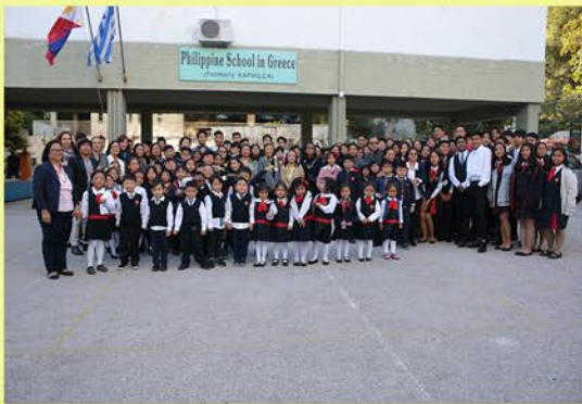
Delegates from the Department of Education and Philippine School Overseas visit the Philippine School in Greece.