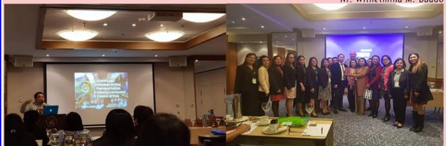
Pinalawig ng mga guro ang kanilang kaalaman at kakayahan sa APSO Convention.